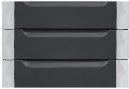
3 x Double Deep

Four drawer configurations per drawer module