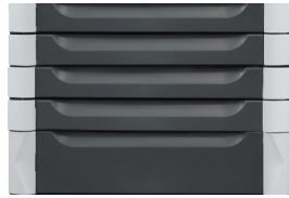
1 x Double Deep + 4 x Single Deep