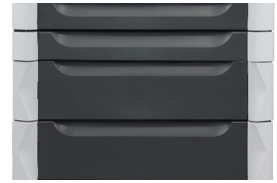
2 x Single Deep + 2 x Double Deep