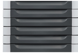
6 x Single Deep