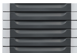
6 x Single deep