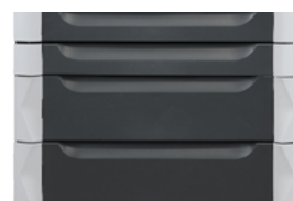
2 x Single deep + 2 x Double deep