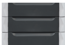
3 x Double deep