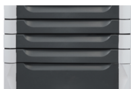
1 x Double deep + 4 x Single deep